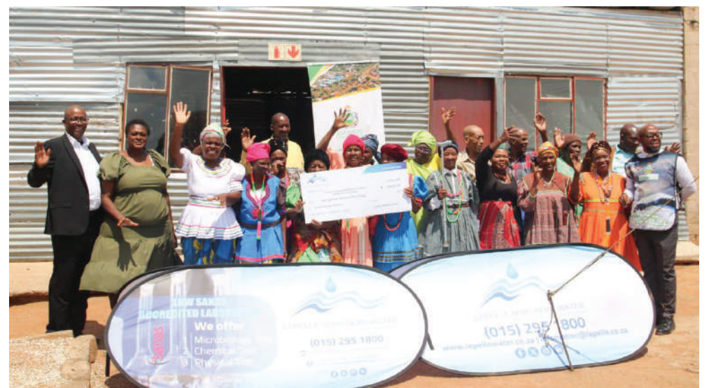
LNW donated R200k to Leeuwfontein Centre