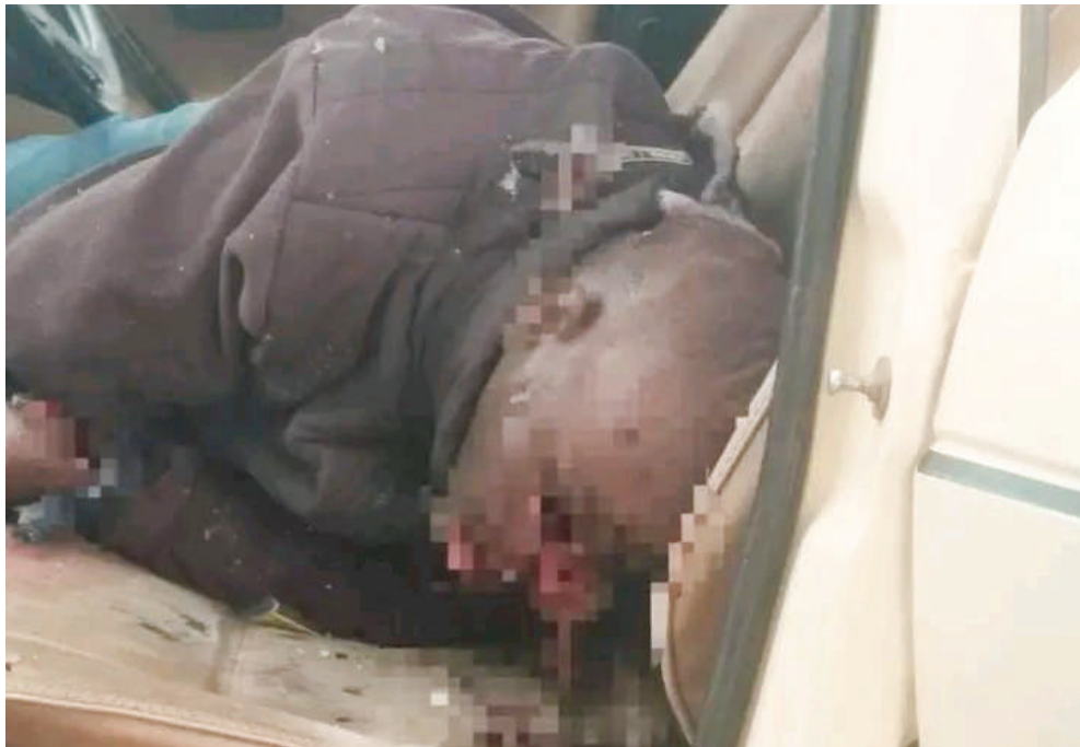
The two victims after they were fatally shot by unknown suspects at Mashitaneng Section in Tafelkop Village.

MOTETEMA - The police in Motetema are investigating two counts of murder and two attempted murder incidents that took place at Mashitaneng Section in Tafelkop Village on Saturday 18 October 2025 at about 12:50.