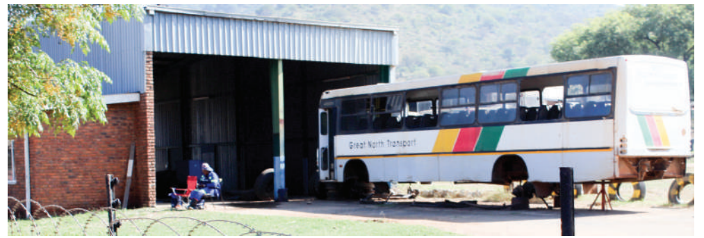
The EFF in Sekhukhune raised a concern about the state of GNT buses allocated to the region.