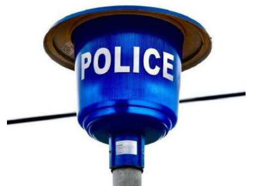
The police in Elandskraal have launched a massive manhunt following a string of armed robberies committed at Kliphuiwel Village in one night.

"We will never allow our community to live in fear of these criminal elements," said General Hadebe.