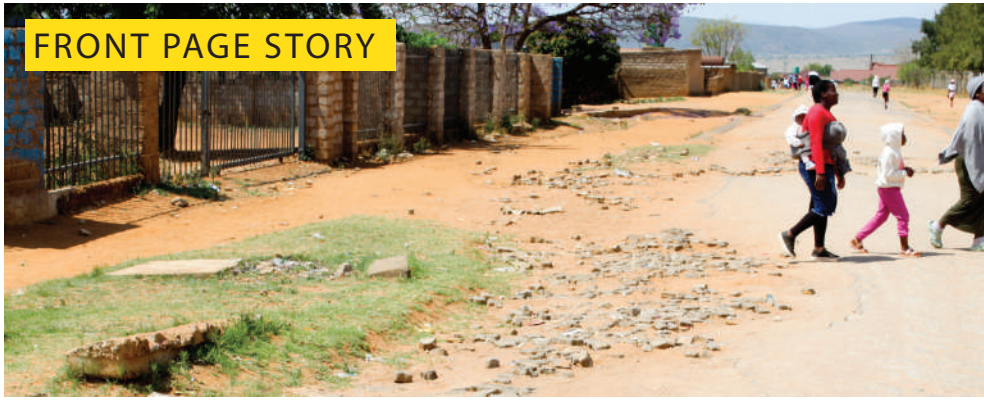
Aggrieved residents say they will demand Makhuduthamaga Municipality to authorize a full forensic audit of the roads tender project.

GLEN COWIE (New Stand) - The community of Glen Cowie(New stand) Village in Makhuduthamaga Local Municipality (MLM) Ward 09, expressed outrage over the substandard construction of a recently paved road in the area.