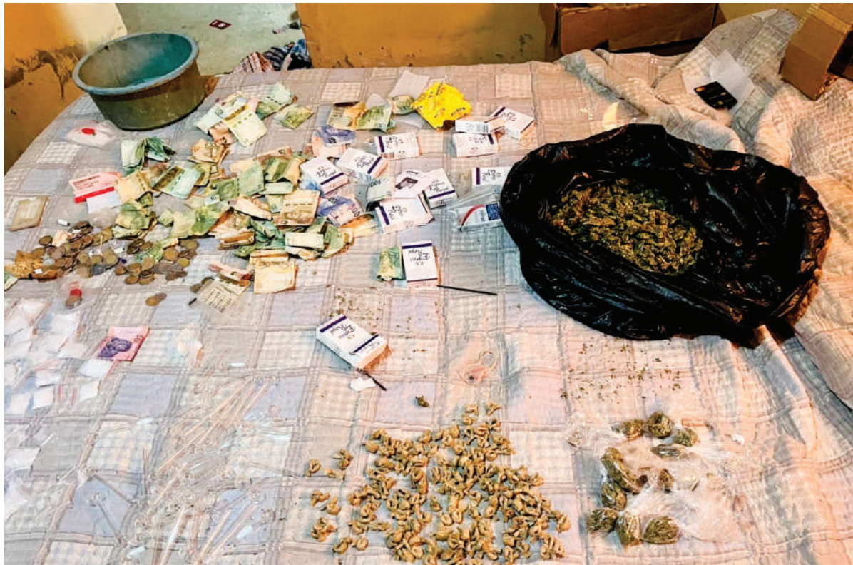
The SAPS confiscated dagga and drugs during the operation.