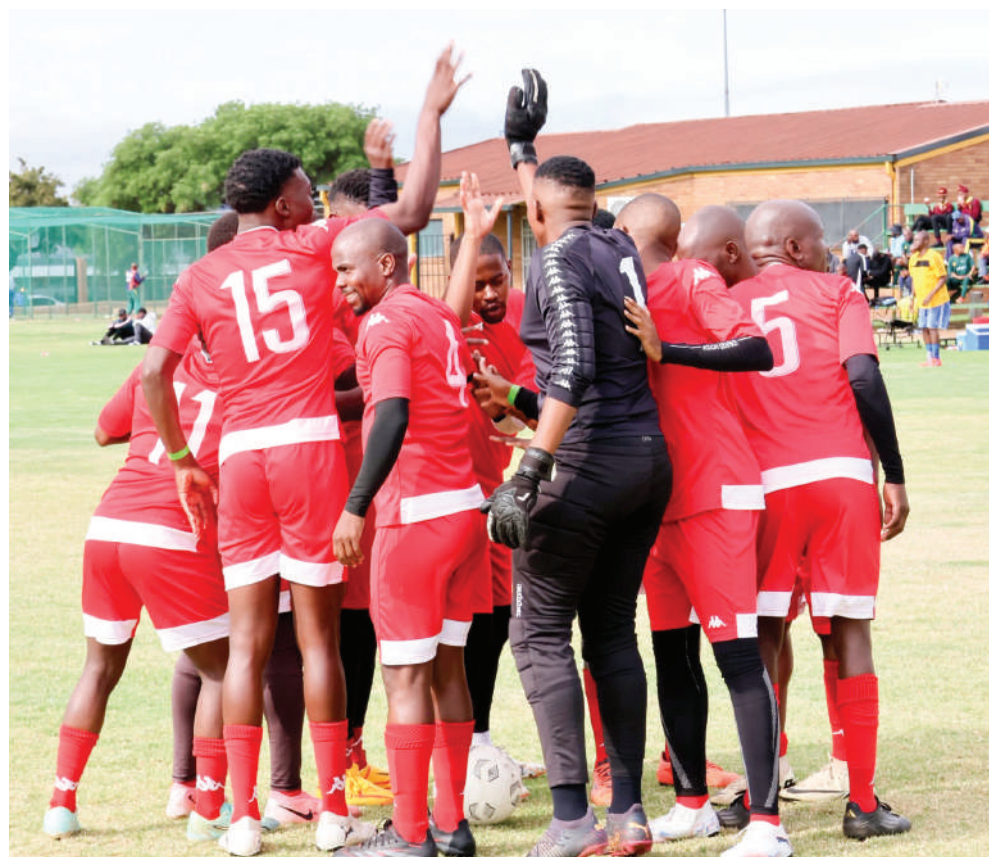
Football teams battling it out during the sporting event, aiming to promote healthy and active lifestyles among public servants.

The participants competed in various sporting codes, including soccer, volleyball, netball, darts, morabaraba, chess, tug of war, table tennis, pool table, and a 5km fun