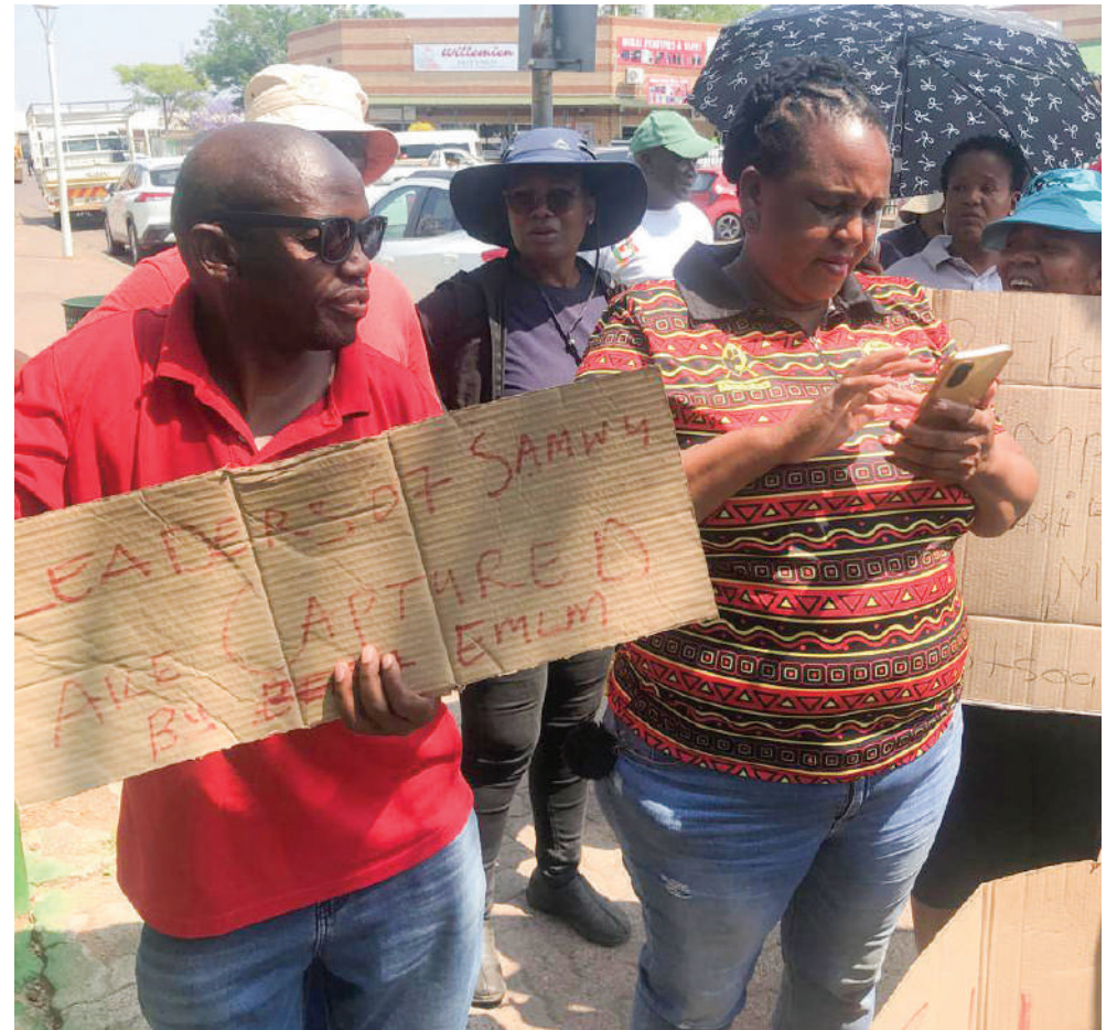
Disgruntled members of SAMWU attached to EMLM during their demonstration at the municipality's entrance in Groblersdal.