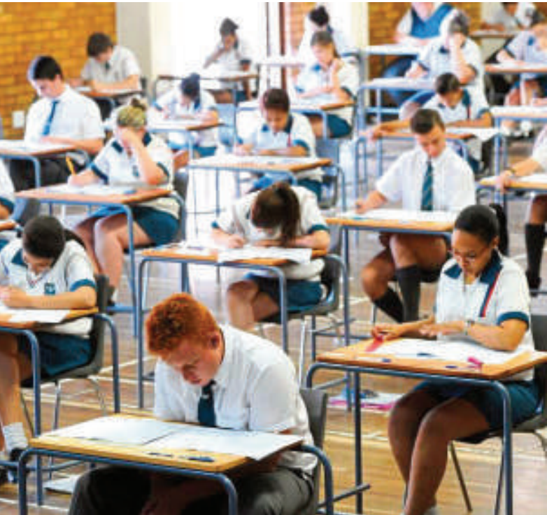
The Limpopo Provincial Government, collaborating with other stakeholders, conveyed message of support to the province's matric students who are sitting to write their final examinations.